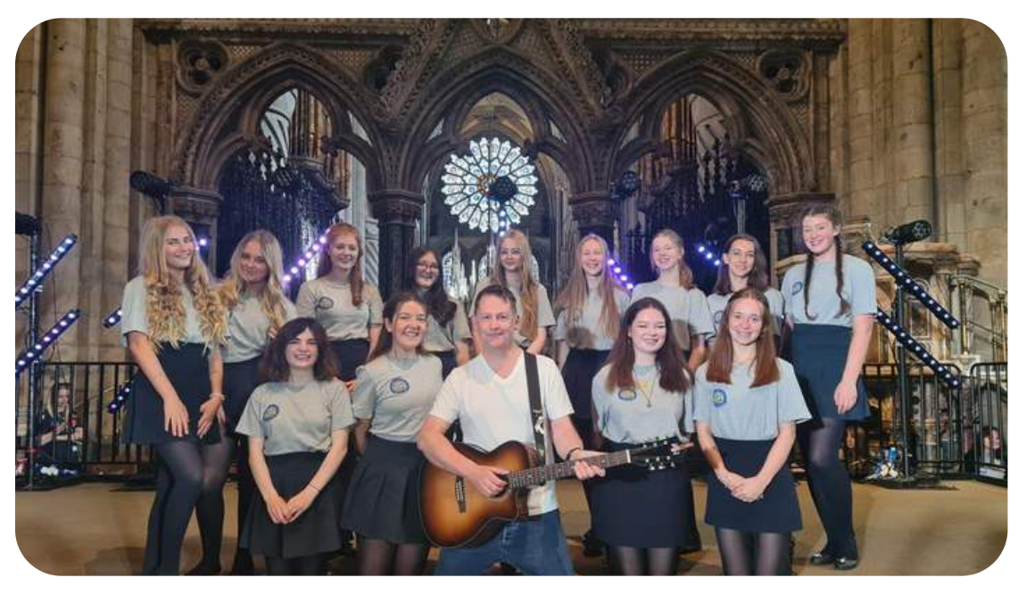
Our Senior Choir members performed at Durham Cathedral as part of our Trust's Musical 'Footsteps into Paradise'.

It allows us to share best practice and training. It gives our students additional opportunities to get involved with other activities, for example music performances at Durham Cathedral in 2022.