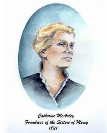
Catherine McAuley 29 th September 1778 – 11 th November 1841