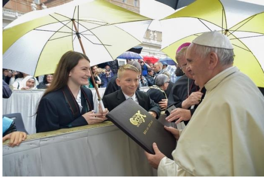
Students from St. Anthony's and St. Aidan's attend an audience with Pope Francis 2016.

In 2012 the school became an Academy and in 2014 St. Anthony's became the lead school within Beacon Teaching Alliance. In 2018 trusteeship of the school passed to the Roman Catholic Diocese of Hexham and Newcastle Our Lady of Mercy Catholic Education Trust was formed. In 2020 St. Anthony's joined with other schools in the area to form Bishop Chadwick Catholic Education Trust, as part of Diocesan re-organisation.