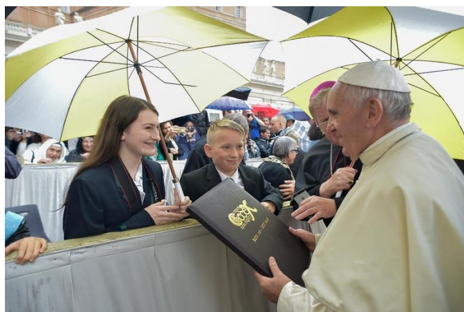
Students from St. Anthony's and St. Aidan's attend an audience with Pope Francis