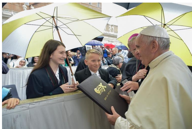
Students from St. Anthony's and St. Aidan's attend an audience with Pope Francis