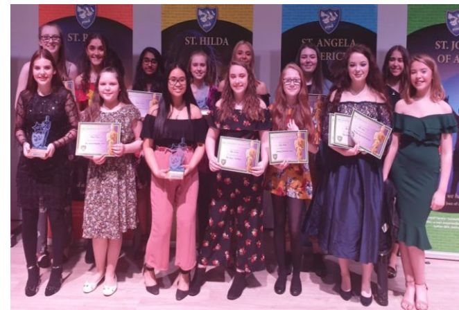
Antonian Award winners for Music