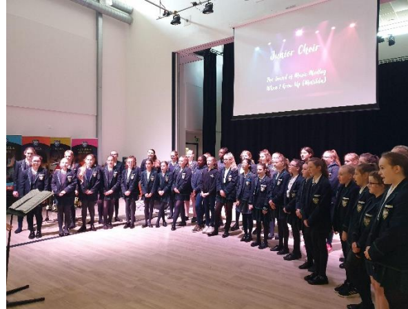
Junior Choir concert performance