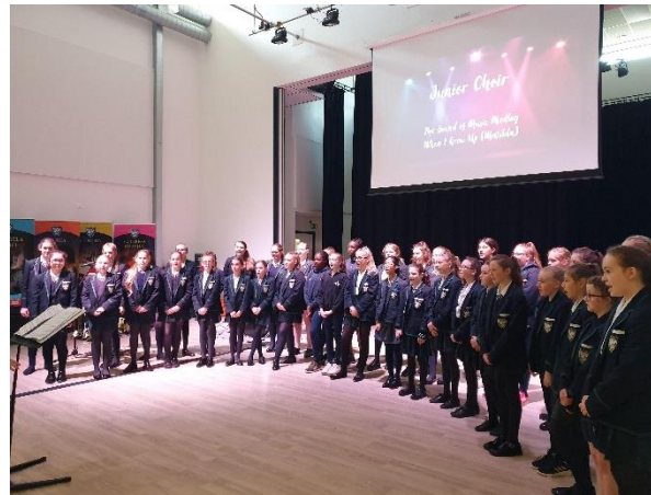
Junior Choir concert performance