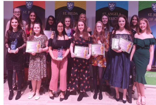
Antonian Award winners for Music