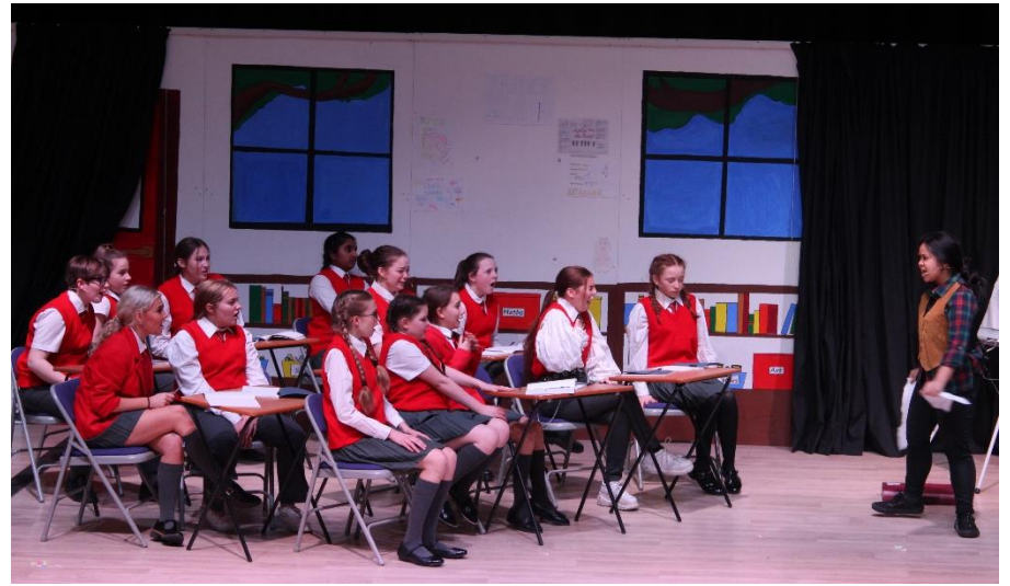
School of Rock 2020