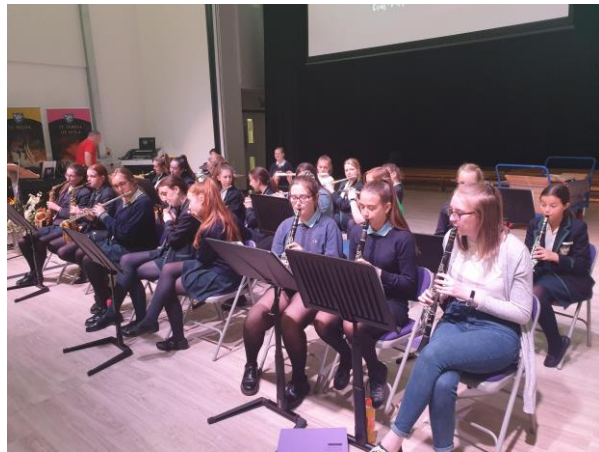
Orchestra concert performance