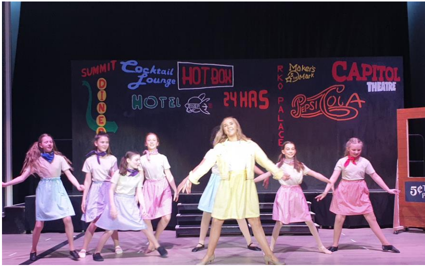
Guys and Dolls 2019