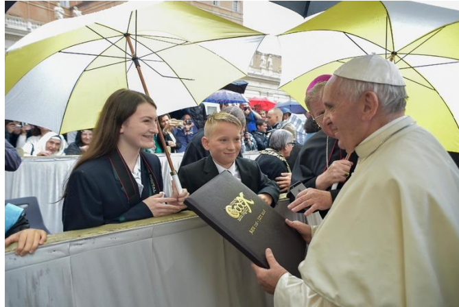
Students from St. Anthony's and St. Aidan's attend an audience with Pope Francis