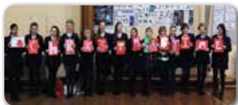
9SMa Christmas Traditions Assembly