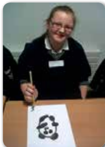
Pupils getting to grips with calligraphy

Chinese characters, learning the art of calligraphy and making paper lanterns. The girls thoroughly enjoyed themselves and learnt a lot from the experience.