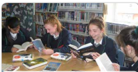
Carnegie Reading Group busy at work

Carnegie panel on 23rd June 2014. The books are available from the library for all senior readers to read. Why not visit the library and give them a go?