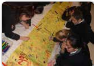
Year 8 Pupils creating the 'graffiti' banner for the Year of Faith celebration.

Year 8 were heavily involved in celebrating the Year of Faith at St Anthony's. Several Y8 girls were proactive in the creation of a 'graffiti' banner for our Educare Centre. Girls applied creative imagery, poems and prayers for the banner celebrating the Catholic Faith and those faiths from other cultures and nations around the world!