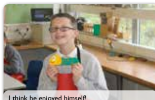
I think he enjoyed himself!