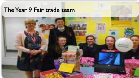
The Year 9 Fair trade team