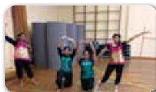
Talented Bollywood dancers

We have very talented students in Y9. As well as our form class assemblies we have seen examples of other talents. Students have practised hymns on a regular basis – what talented singers! We have also had a group of Bollywood dancers, three-legged racers and seen basketball skills. Thank you for all our special God-given talents.