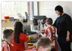
The day before the cup final!