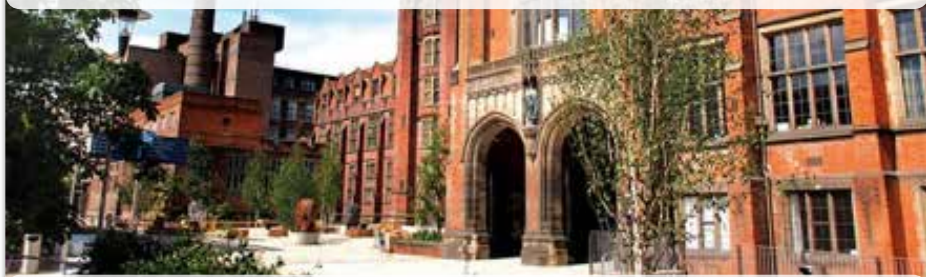
The historic archway on campus at Newcastle

The History Department have been keen this year to continue our strong links with local universities. Following a successful visit of Y13 pupils to Sunderland in September, in February we took our 40 Year 12 students to Newcastle University. The girls enjoyed a day of lectures provided by University staff which were specifically tailored to their Y12 syllabus. They were able to engage with a different way of learning and a higher level of thinking, and had the opportunity to ask questions about future pathways. The girls were also taken on a tour of the university campus, which despite the rain was enjoyed by all. We hope to continue this excellent link in the coming years and continue to provide this fantastic experience.