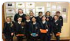
9SAa April Fool's Day Assembly