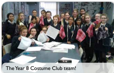
The Year 8 Costume Club team!

Each week is great fun and I hope The Costume Club continues next year with the same wonderful level of enthusiasm and creativity. Well done to everyone in The Costume Club!