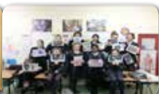
9STo Discovery of Penicillin Assembly