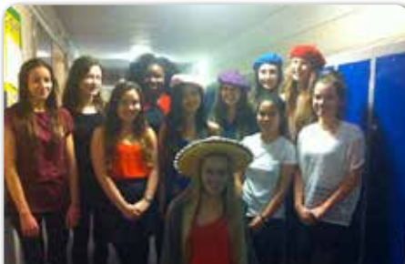
6th Form pupils getting into the European spirit!