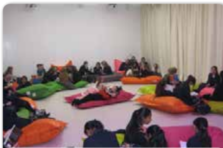
Reading in the Educare Centre