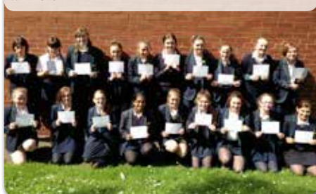
Year 10 Mathematics Challenge certificate winners