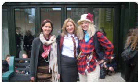
Staff dressed as their favourite literary character. Can you guess the character?