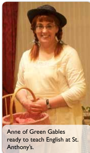
Anne of Green Gables ready to teach English at St. Anthony's.

On a serious note, taking part in this day is an enjoyable yet extremely important way to continue to stress the message that not only is reading good fun and an absorbing hobby, but it is a vital part of our pupils' continued academic success.