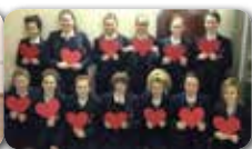
9SAo Valentine's Day Assembly