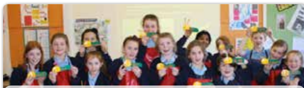
Pupils from St. Cuthbert's Primary School displaying their caterpillars

The students have all enjoyed their afternoon working at St. Anthony's, and the staff have all commented on how valuable an experience it was for their students.