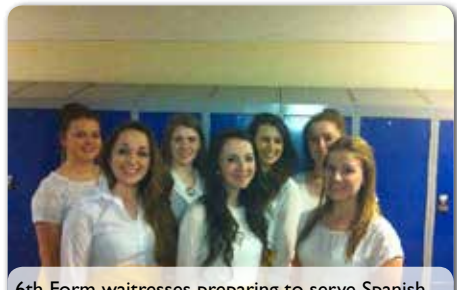
6th Form waitresses preparing to serve Spanish and French food